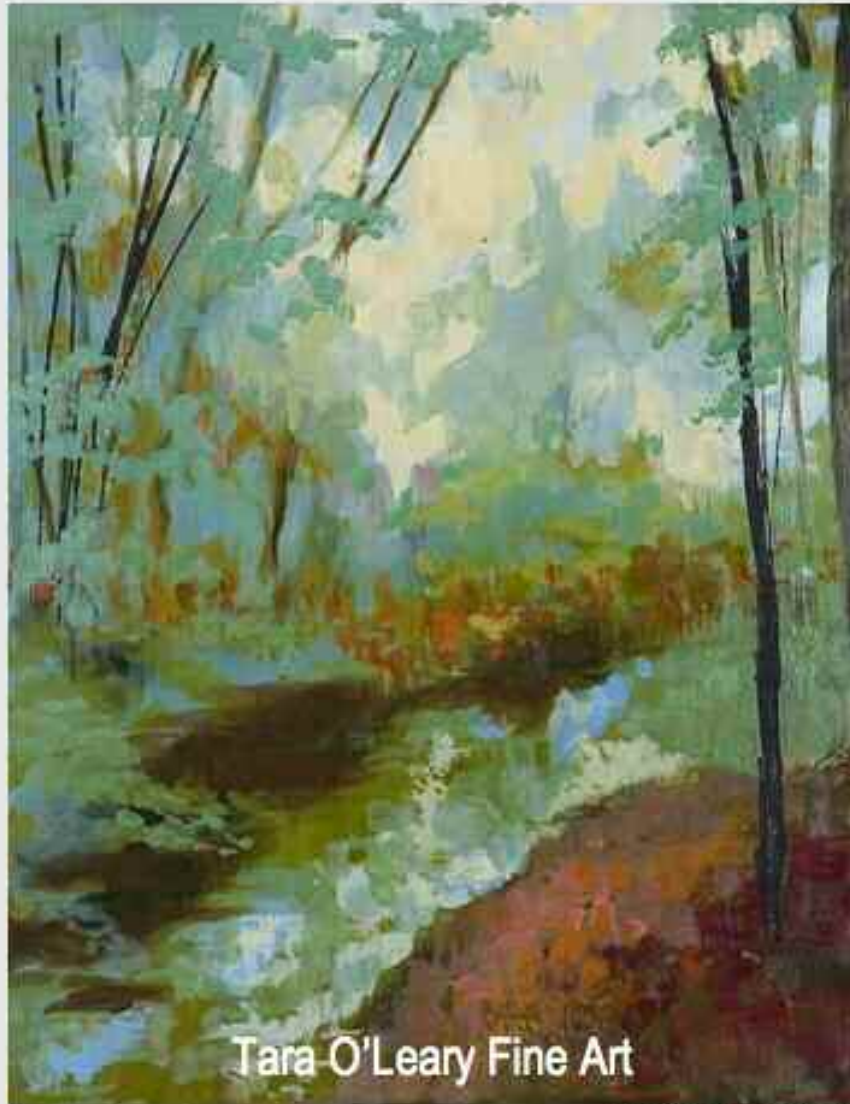
Tara O'Leary Fine Art

My New work includes South Mountain New England and Abstracts, in Pastel, Oil and Encaustic.