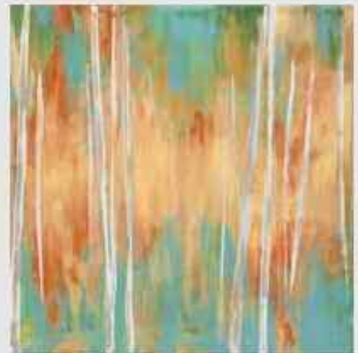
Birch Trees, Encaustic

I'm teaching pastel workshops monthly at Geralyns in Maplewood, call Geralyn 973.275.1966 to sign up. Pictures and overview on the blog at www.taraoleary.com .