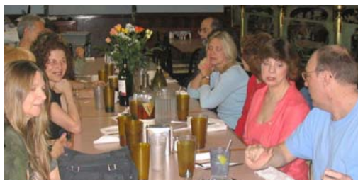
The board members