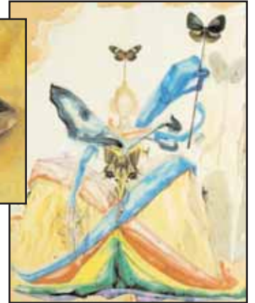
Salvador Domingo Felipe Jacinto Dalí i Domènech , 1st Marquis of Púbol (May 11, 1904 – January 23, 1989) was a Spanish Catalan surrealist painter born in Figueres.

Dalí was a skilled draftsman, best known for the striking and bizarre images in his surrealist work. His painterly skills are often attributed to the influence of Renaissance masters. His best-known work, The Persistence of Memory , was completed in 1931. Dalí's expansive artistic repertoire includes film, sculpture, and photography, in collaboration with a range of artists in a variety of media.